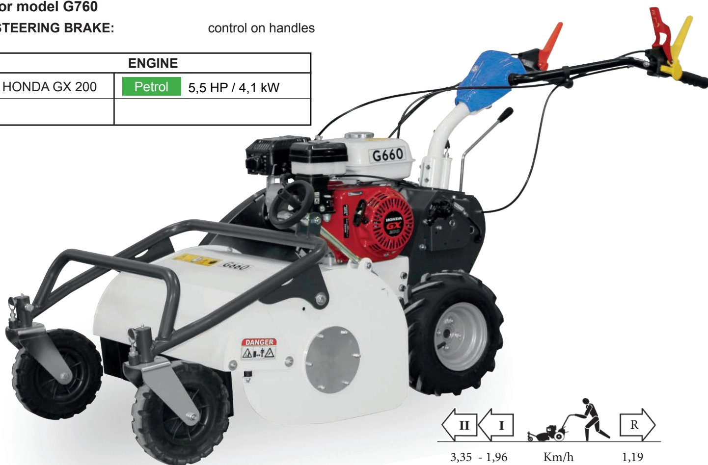
rotary tiller with Y blades